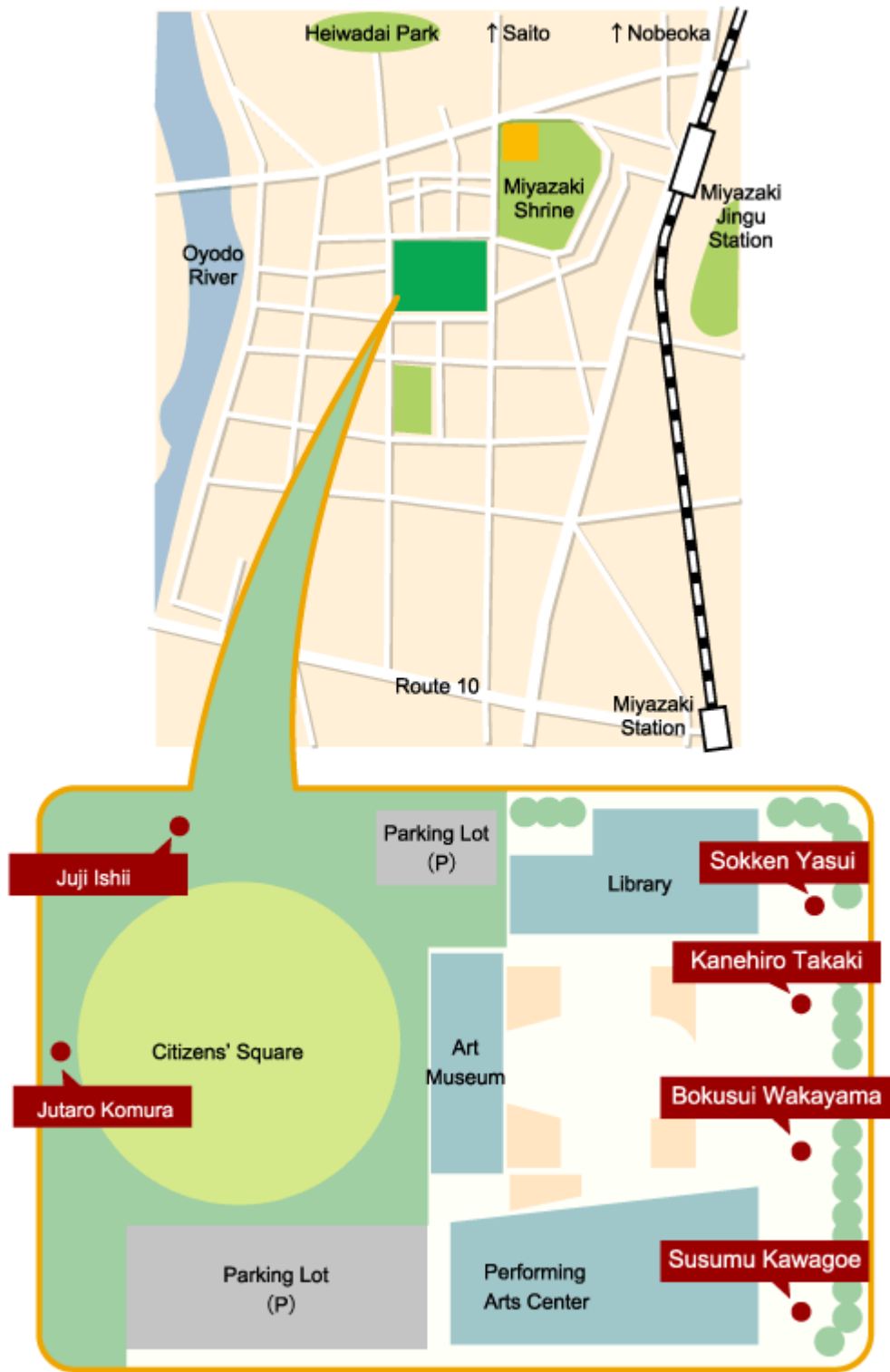
"Miyazaki Prefecture General Culture Park" (Miyazaki City)